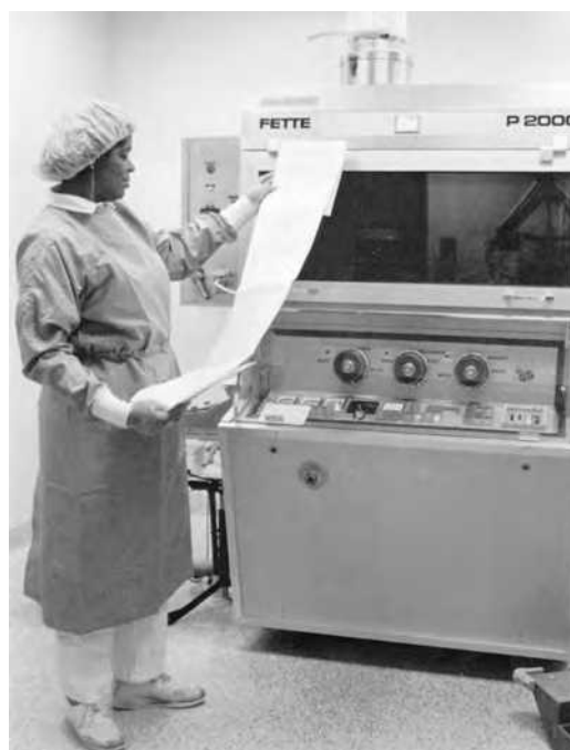
FIGURE 8.8 Quality control in the manufacturing of tablets.

In addition to the apparent features of tablets, tablets must meet other physical specifications and quality standards. These include criteria for weight, weight variation, content uniformity, thickness, hardness, disintegration, and dissolution. These factors must be controlled during production (in-process controls) and verified after the production of each batch to ensure that established product quality standards are met (Fig. 8.8).