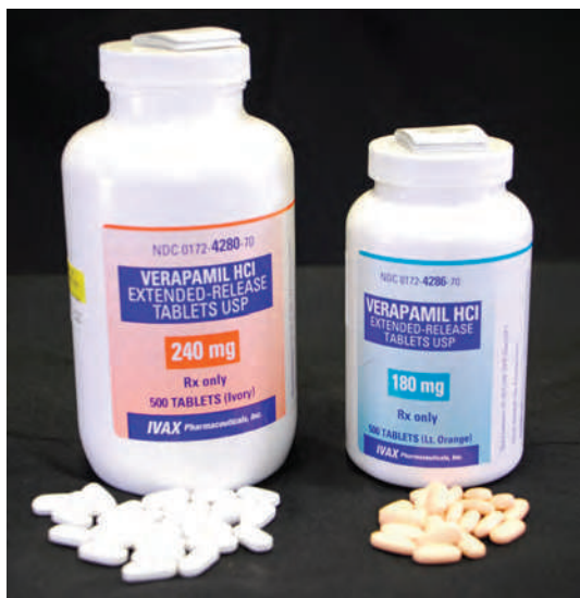
FIGURE 8.6 Packages of a drug product of different tablet strengths.

Tablet diameters and shapes are determined by the die and punches used in compression. The less concave the punches, the flatter the tablets; conversely, the more concave the punches, the more convex the resulting tablets (Fig. 8.7). Punches with raised impressions produce recessed impressions on the tablets; punches with recessed etchings produce tablets with raised impressions or monograms. Monograms may be placed on one or on both sides of a tablet, depending on the punches.