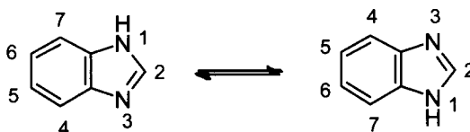
Benzimidazole Numbering and Tautomerism

The parent compound, benzimidazole, is a crystalline solid with a melting point of 169–171 °C. Benzimidazoles, like imidazoles, exist as a tautomeric pair of compounds. The tautomerism of 1 H -benzimidazoles is sufficiently rapid that the compounds are observed as a single species on the NMR timescale at room temperature. 37 1 H -Benzimidazoles with substituents at the 4(7) or 5(6) positions appear to be a single compound rather than a tautomeric mixture; however, replacement of the NH proton with an alkyl group or other substituent results in formation of a pair of regioisomeric compounds. Thus, regioselectivity is a consideration in the synthesis of all N -substituted benzimidazoles that bear any substituents at the C4–C7 positions.