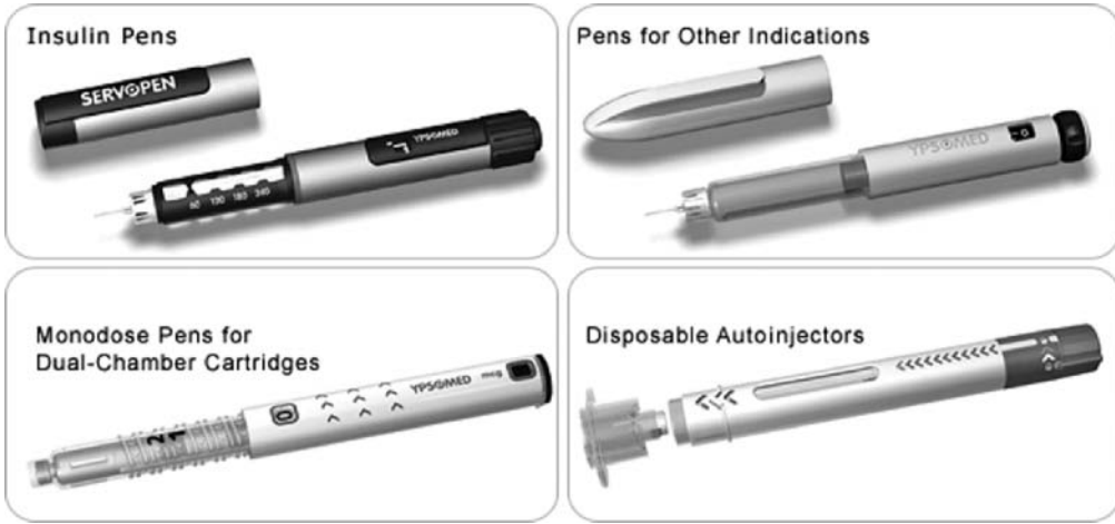
Figure 4-11 More examples of pens and autoinjectors.