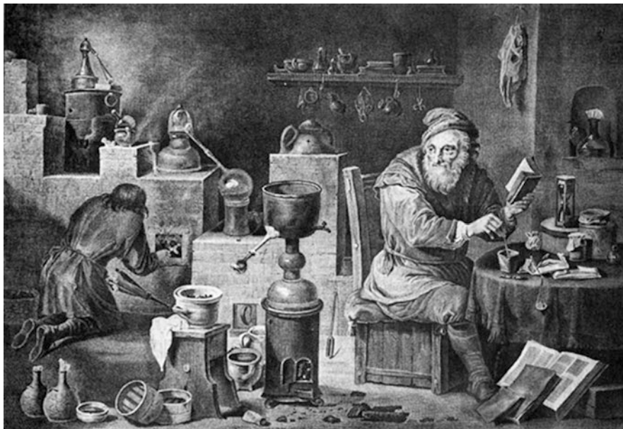
Fig. 4 “Der Alchemist” engraving by Pérée from a painting of David Teniers (1610–1690) illustrating the structure of small labs still retained today